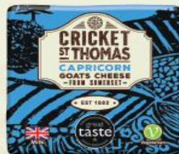
Goats Cheese 1x1.1kg**

TO ENTER 4/9/2023 – 6/10/2023: https://lactalispro.co.uk/british-provenance/best-of-british/win-1000