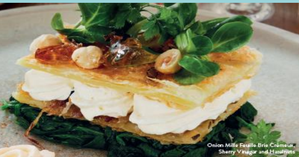
Onion Mille Feuille Brie Crèmeux, Sherry Vinegar and Hazelnuts