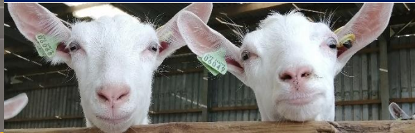
Verney's Farm Produce Honest local produce fresh from their Devon farm