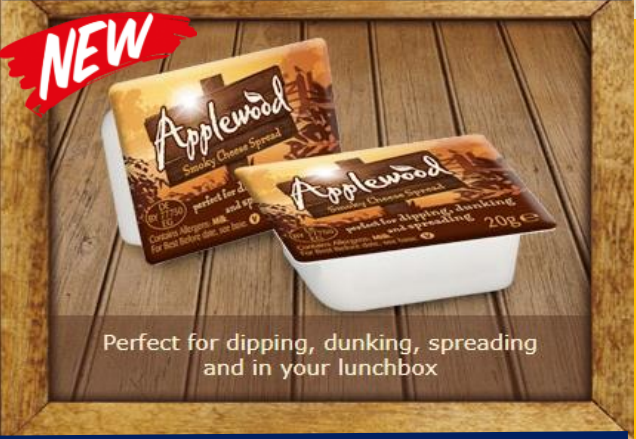
Applewood 20g SPREADABLE