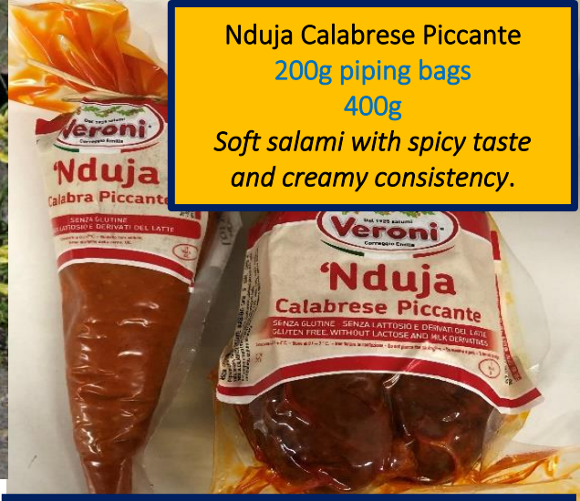
Nduja Calabrese Piccante 200g piping bags 400g Soft salami with spicy taste and creamy consistency.