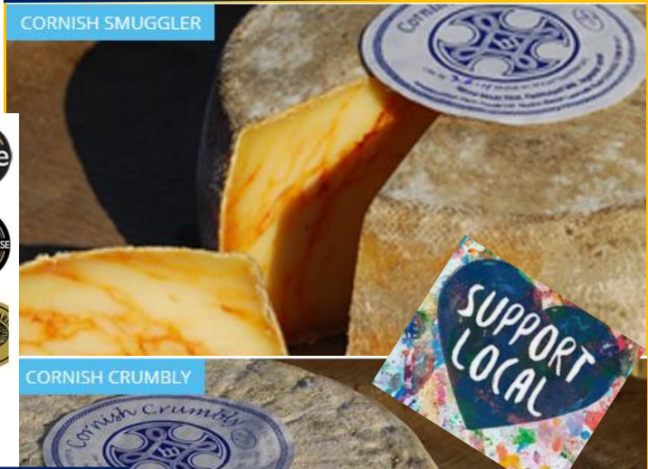
Whalesborough Cheese A family business on the North Cornwall coast, making award-winning hand made batches of top quality artisan cheese!