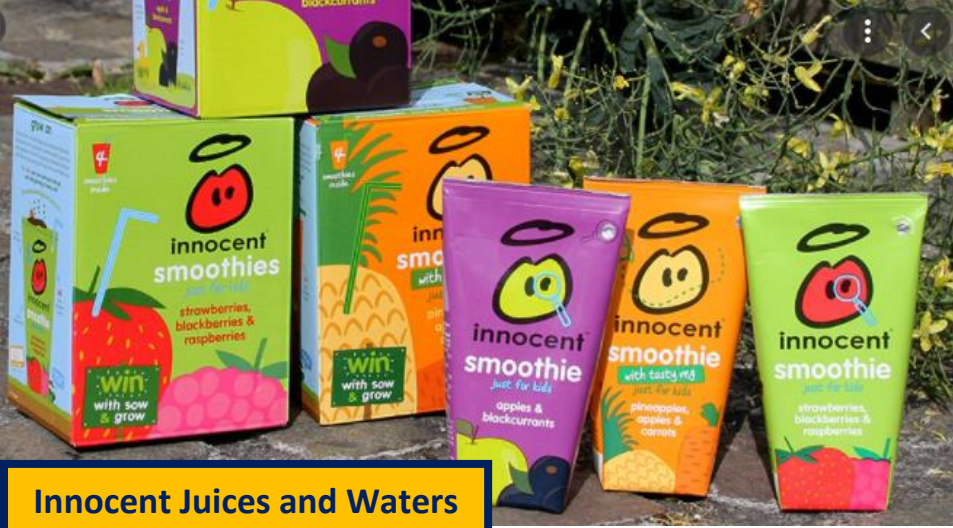
Innocent Juices and Waters